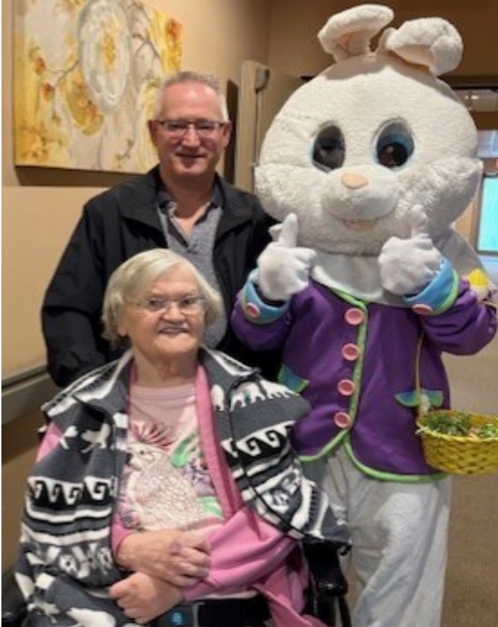
Decorating Easter Basket and Hats